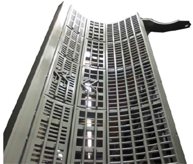
Concave showing both small grain and large grain boxes installed to show the difference.

These concaves can be ordered as small grain or large grain. The front half of each concave consists of a channel structure weldment that will provide strength and durability. Each concave accepts bolt in "boxes" that are reversible, replaceable and shear bolt protected as an additional safeguard for your combines' processor. Front mounting pins on these concaves are boronized to prevent wear of both the pin and bushing.